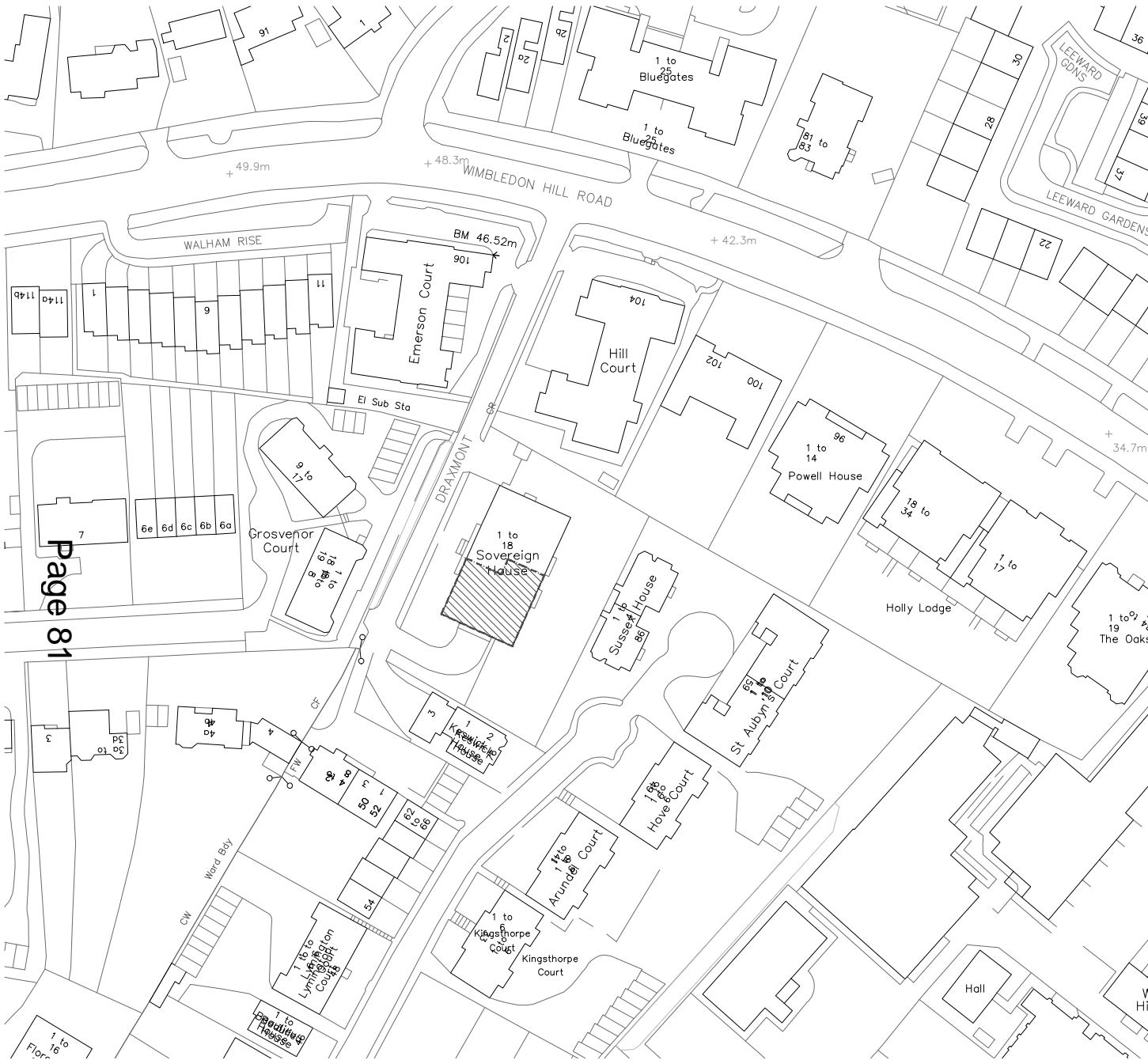
EXISTING SITE PLAN 1:500 @ A1