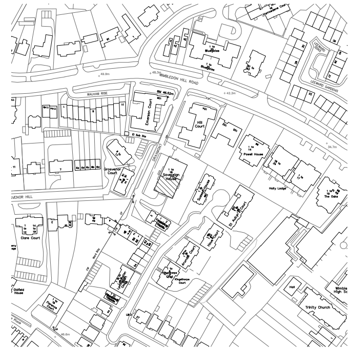
LOCATION PLAN 1:1250 @ A1